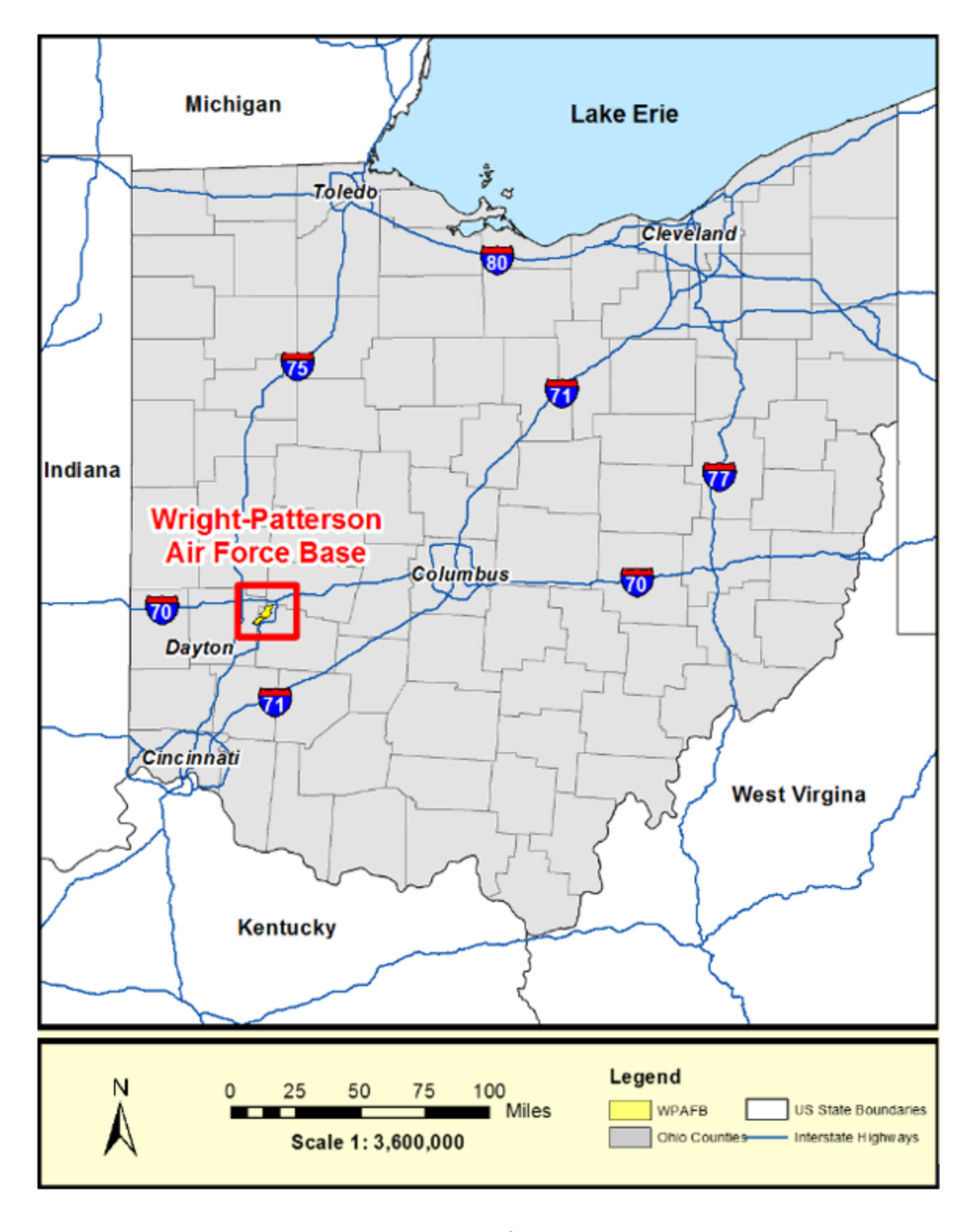
USGS Map of WPAFB